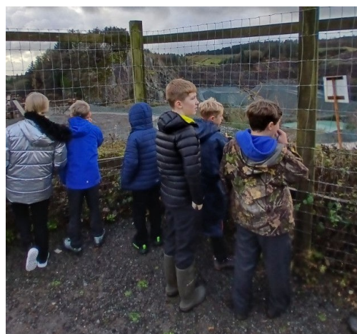
Touring the improved rock park