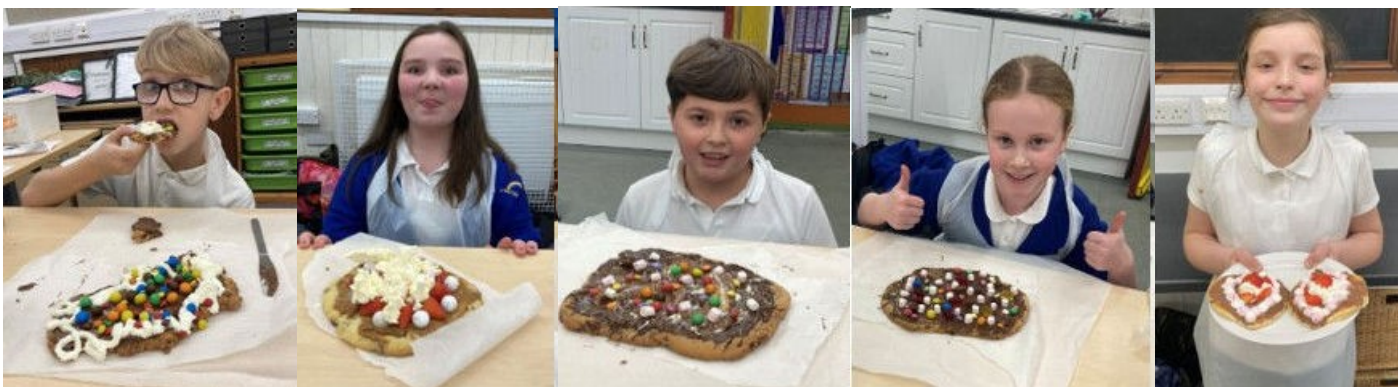
Pizzas to be proud of!