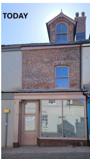
14 St George's Terrace