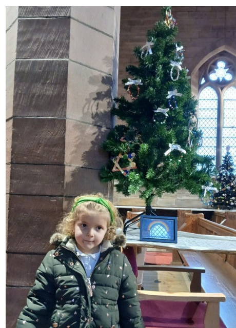
Tree decorations made by the children