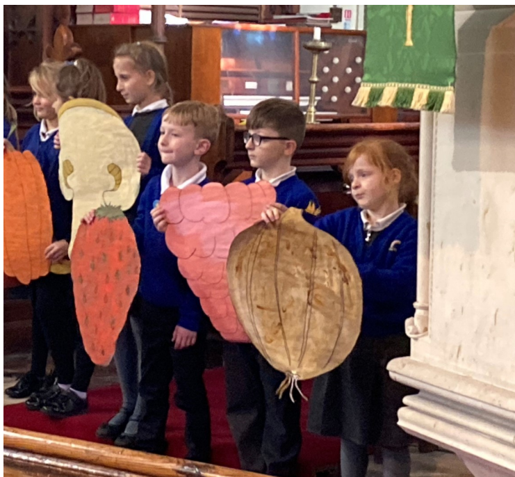
Harvest festival fruit and vegetable paintings

Children in Class Three have enjoyed learning all about Ancient Greece this half-term. They have been writing a diary entry based on the Greek myth of the minotaur and have designed and made Greek tiles out of clay. In history, the children have learnt about democracy, the daily life of ancient Greeks and Alexander the Great and have held a debate about which city state they believed would have been the best to live in. Children in Class Three also enjoyed participating in a tag rugby tournament at Millom RLFC.