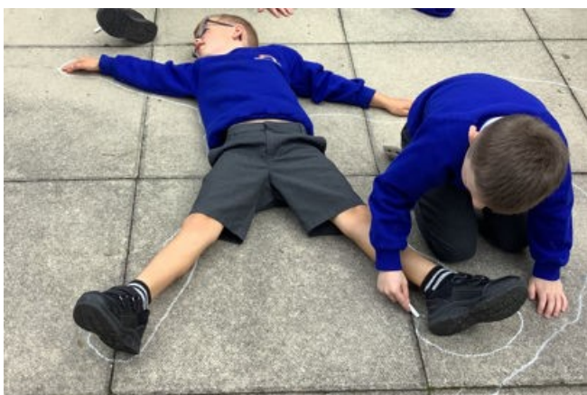
Drawing chalk bodies

Year Two have been learning about the human body and senses, drawing chalk lines around each other and labelling various body parts as well as drawing wonderful self-portraits using a variety of media.