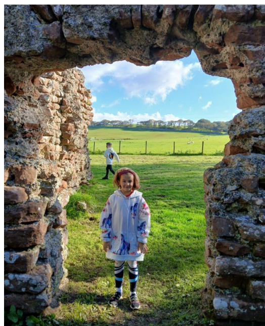
Learning about Roman history

In science, the class have been exploring animals including humans and have looked at the different types of skeletons, nutrition and muscles. The children enjoyed exploring different types of food labels to identify if the food that they are eating is healthy.