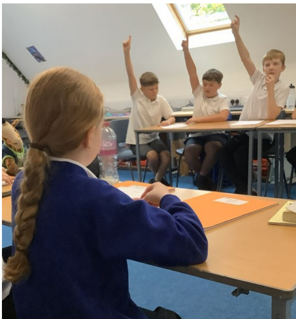
Holding a debate about Greek cities