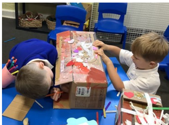
Having fun making 'happiness machines'

Nursery and Reception have had lots of fun this half-term. They have enjoyed mark making in glittery sand and making patterns with all sorts of shapes, colours and objects. They have also been putting their crafting skills to the test making imaginative 'happiness machines' out of everyday recyclables.