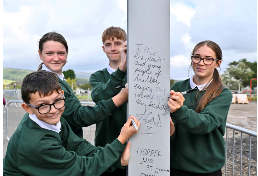
Pupils from Millom School took part in the steel-signing event

The Copeland Community Fund has provided £1 million towards the project and the Nuclear Decommissioning Authority has provided a £3.1 million grant, as part of its investment in supporting permanent and sustainable change in Millom and all its site communities. Funding has also been provided by South Copeland GDF Community Partnership, CGP, Millom School and Millom Town Council.