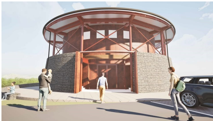
Artist's impression of the Iron Line visitor centre

The Iron Line will turn the Hodbarrow Reserve and former railway line into a 7.5km accessible walking and cycling route, supported by public art, cultural features, and a community-led visitor centre with a café, event spaces, and accessible facilities.