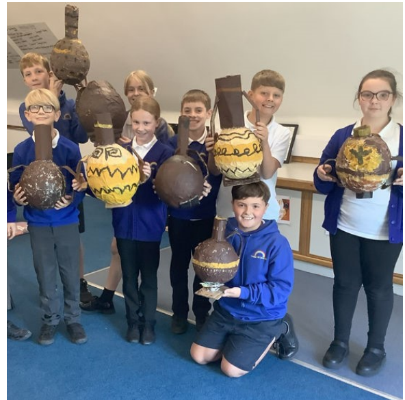
Making Greek vases ..... and the finished article