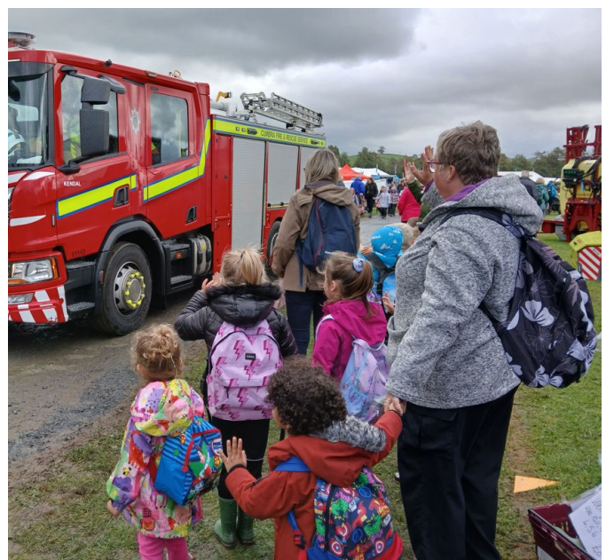
Meeting firefighters at Westmorland Show

The nursery, reception and Year Two children enjoyed a lovely day at Westmorland Show. The rain failed to dampen spirits as the children explored the event in big coats and wellies. They had the opportunity to climb on fire engines and meet firefighters, heard stories about police dogs, enjoyed looking at entries for various competitions and even bought a new mascot (a knitted bear) for school called 'Wes'. The day ended with juice and cake before heading back to school. As always, the children were very well behaved and represented the school well.