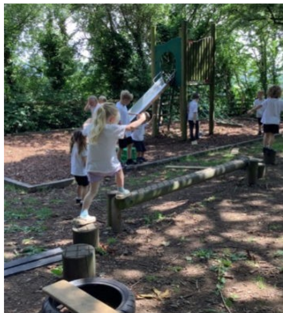
Helping each other to navigate a course