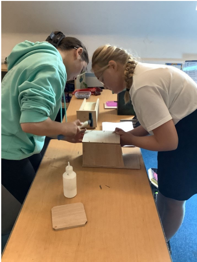
Using practical skills to make bird boxes

The children in Class One have been learning about resilience and being supportive. They built a course to follow and then encouraged and helped each other and the nursery children to navigate it. They had lots of fun and learned about the value of resilience and supporting each other when things get challenging. Well done Class One!