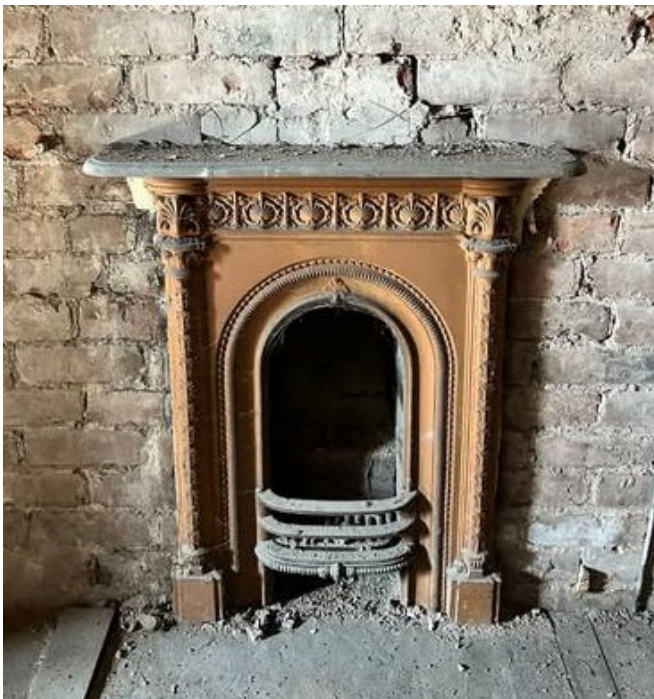
One of the original fireplaces will be reinstalled

In the arts and crafts area on the ground floor, we're keeping the old safe as a feature too. It's a solid reminder of the building's history - even if, disappointingly, we didn't find any forgotten fortunes inside!