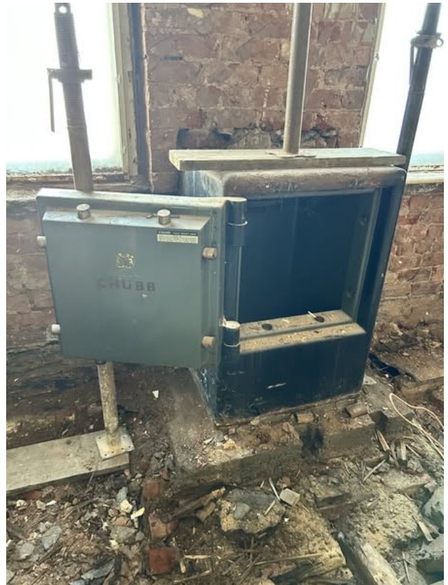
A reminder of the past: the former bank's safe