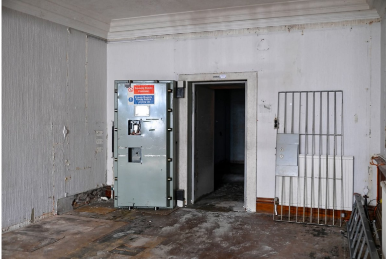
The old vault door will be a serving hatch for the new café

Things are taking shape at the Old Bank - part of the Millom Town Deal - and as work progresses we are uncovering parts of the building's story were excited to preserve and share.