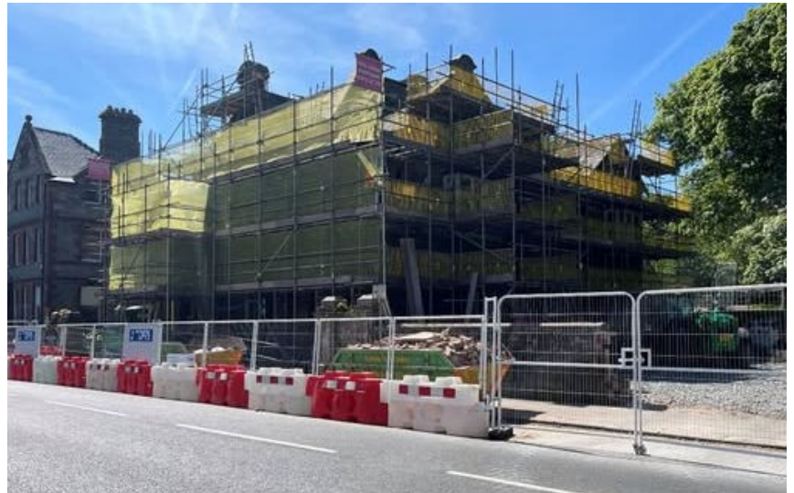
External scaffolding is now fully installed

The second floor has also seen good progress, with all plaster removed from internal walls and timber treatment works completed in full.