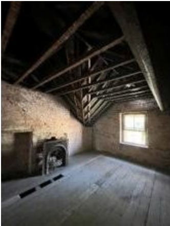
Plaster has been removed and timber treatment carried out

Led by Cumbrian business, Story Contracting Limited, the Reactivating Heritage Buildings project is bringing this iconic former NatWest building back to life. So far, some structural repairs, damp proofing, timber treatment, and major internal works have been completed across all three floors.