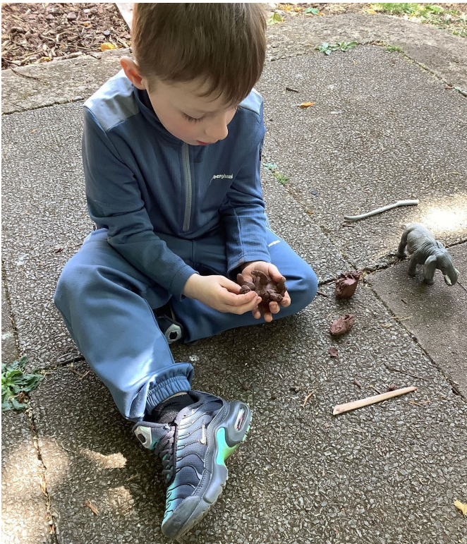
Making clay animals for the newly-created savannah

In Class One, the children have enjoyed learning all about animals. This has included creating a savannah in the school grounds, complete with grasslands and a watering hole. They also spent the afternoon creating wild animals out of clay outside in the sunshine, whilst the nursery children have been busy, 'going on a lion hunt'.