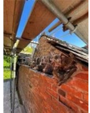
Major internal works have been completed

On the ground floor, damp proofing has been successfully completed, and preparatory work is underway to create new structural openings in line with the approved architectural plans. Steel beams are expected on site shortly to facilitate further internal modifications, and final design work is ongoing for the floor slab and access to the building's original safe room.