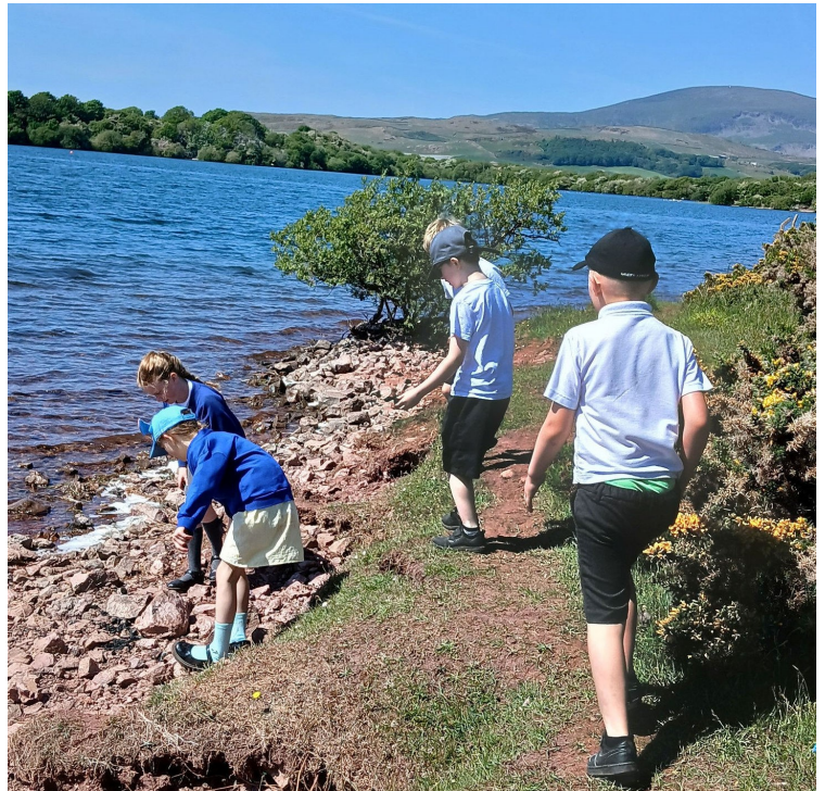
Inspecting the water at Hodbarrow Lagoon

This half-term the children in Class Two have been learning all about water in science. As part of their learning they visited Black Beck river to identify and understand what factors affect the movement of water in rivers and spent an afternoon at Hodbarrow Lagoon. They observed water movement, had fun with the placement of rocks to change the direction of flow and tested the quality of the water using reagent strips.