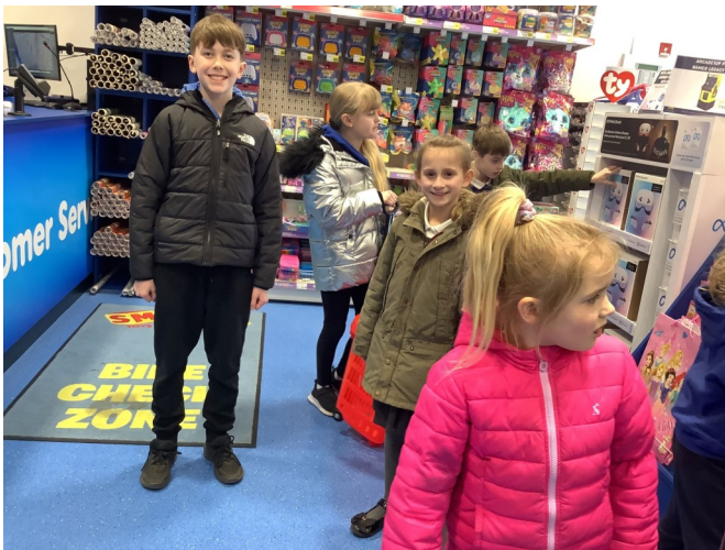
Re-stocking the Rainbow Shop

As you may remember, Thwaites School have developed a Rainbow Shop at their school filled with lots of wonderful toys and stationery that the children can buy using Rainbow notes, earned through displaying the school values. After a year of success, the Rainbow Shop stock was getting low, and so, with money kindly donated by the Village Hall, the school council took a trip to Smyth's Toy Superstore to replenish the goodies, armed with a shopping list compiled by the pupils of the school. They had a wonderful day and are now looking forward to setting up the shop with the new stock. Watch this space.