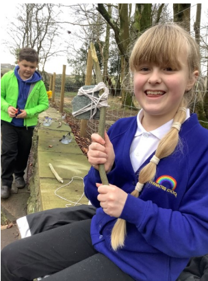
Making stone age weapons

enjoy a luxury hot chocolate with delicious cakes and biscuits. The launch was a roaring success, with every child in school managing to achieve 10 independent reads. Keep up the good work everyone!