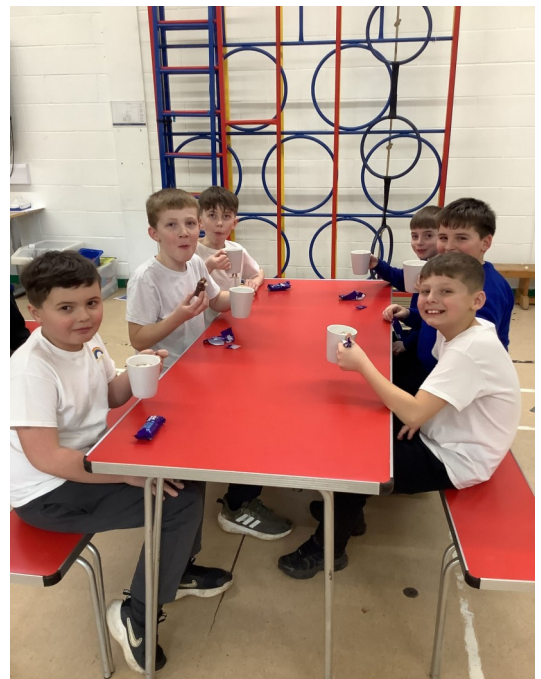
Chocolaty treats reward successful reading