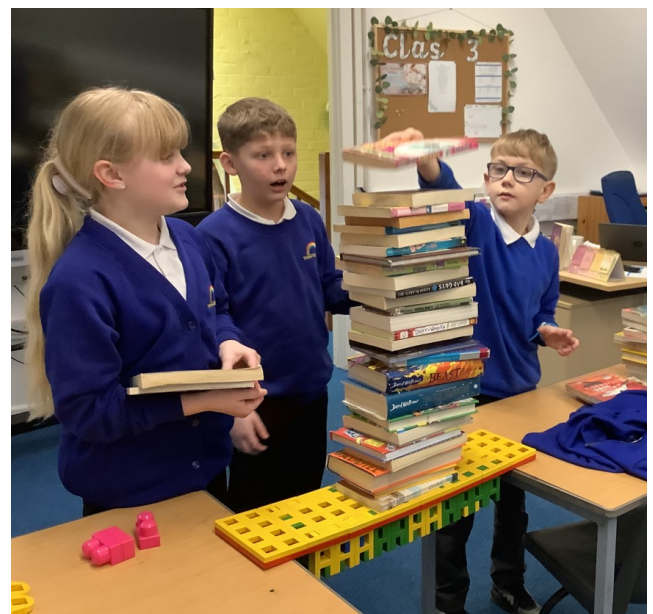
How strong is our bridge?

Young engineers were given the chance to shine during a STEM bridge building project. Children were given an afternoon to research, design and build a bridge from construction materials that would hold a kilogram weight. The children displayed fantastic teamworking and problem-solving skills to build strong bridges that met the design criteria. The children really enjoyed having the freedom to make mistakes and improve and showed the school values of resilience and enthusiasm.