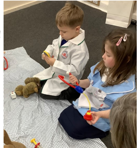
Learning to care for animals

The children in nursery have been learning about farm animals and how we care for them and have had such fun role-playing as vets and farmers. There have been many a sick and poorly teddy bear this week and the children have worked diligently to bandage them up, give them their medicine and care for them until they get better.