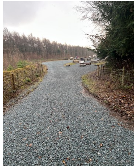
New stone path to Millom Rock Park

We have already started to redo the paths and top area by scraping off the old coverings and replaced it with fresh stone. We hope you agree that this is a good start.