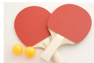
TABLE TENNIS 6—7.30pm