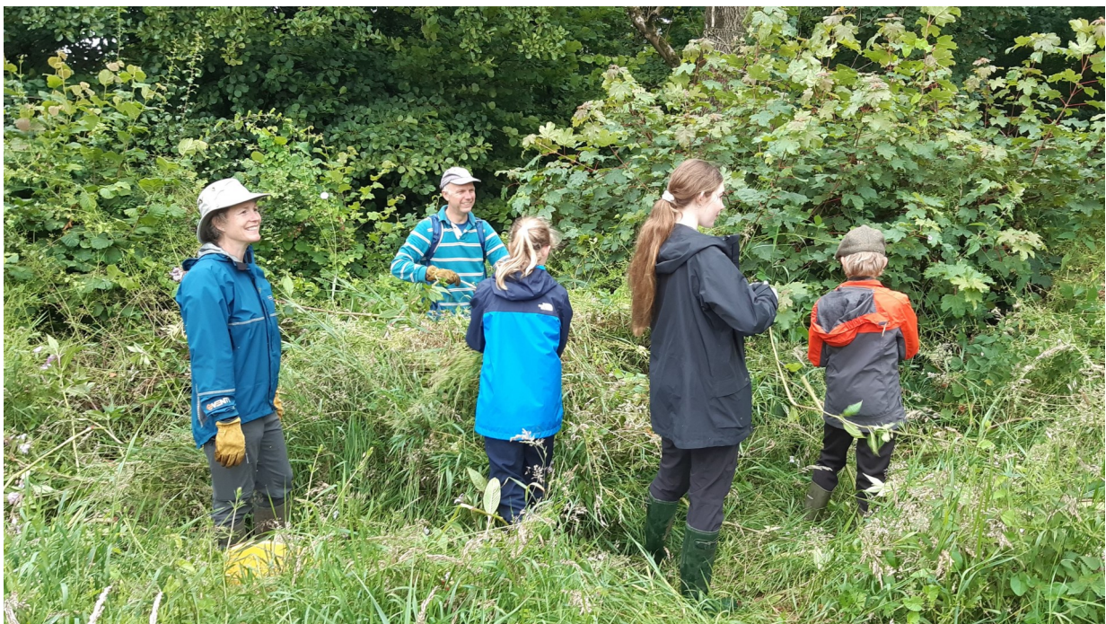
Eradicating Himalayan balsam: many hands make light work

Himalayan balsam bashing - weekly work parties from June to September will continue the great progress we have made eradicating this non-native species. These two-hour sessions require a degree of physical effort.