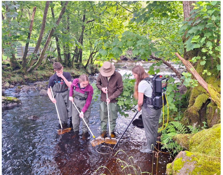
Electrofishing to check the status of fish populations

Electrofishing - each survey requires several volunteers to spend a day alongside a trained leader. Volunteers need to be fit enough to wade in becks.