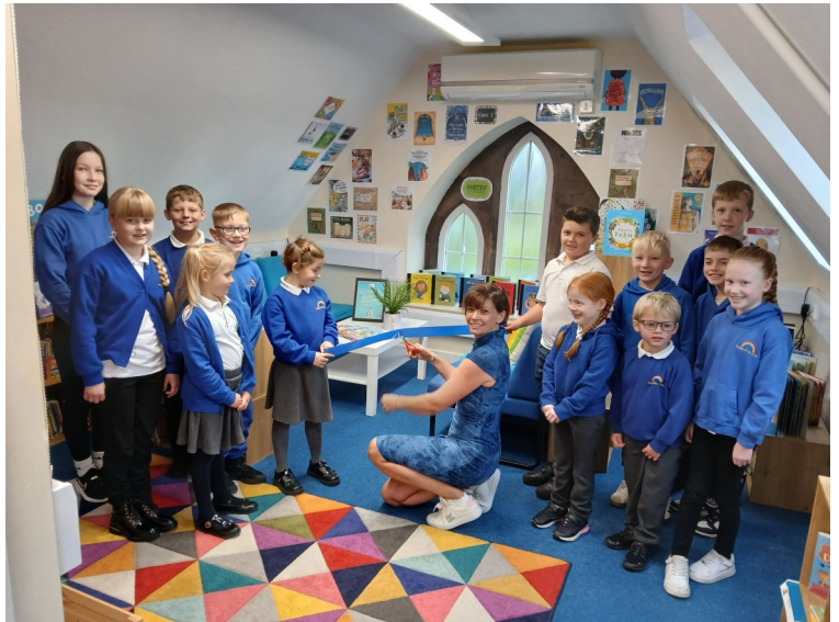
New library opening

To begin the new academic year, Thwaites School have overhauled their school library to promote the love of reading they want their children to develop and sustain. The two school libraries have been turned into one colourful and exciting library with the help of the Library Service. The children can now enjoy reading in comfort and choose from a wide selection of modern titles from a diverse variety of authors. They have removed all book bands so that children have much more freedom of choice and introduced comics and magazines for children's reading pleasure. The library has been