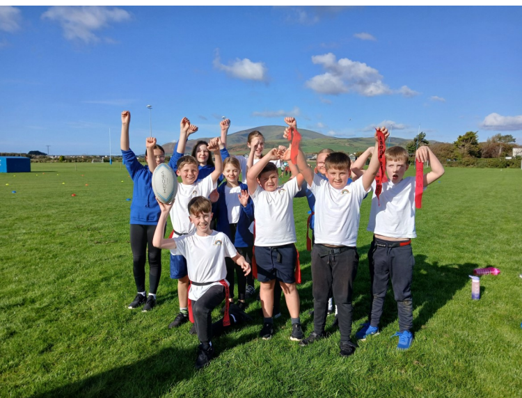
Celebrating sporting achievements