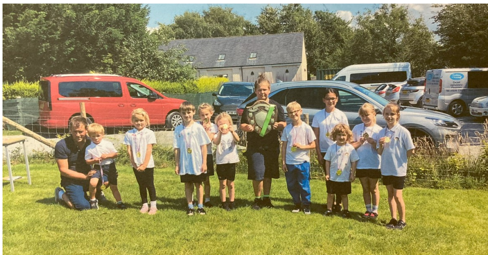
Coniston: the winning sports day team

On a blisteringly hot day, Thwaites School held their annual Sports Day on the school field. Parents, carers, family and friends flocked to the school to sit in warm sun and enjoy a brand-new sports day format that included field and track events taking place at the same time. The children competed in the teams Windermere, Coniston and Ullswater and cheered each