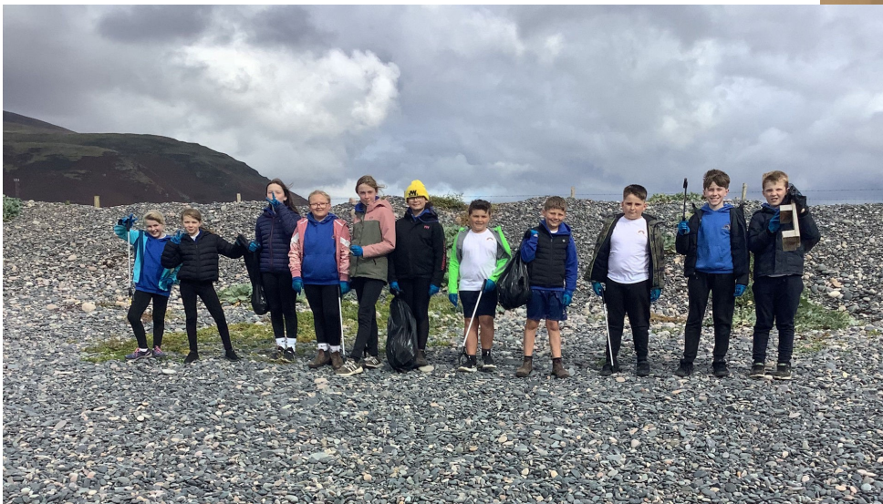
Litter picking on Haverigg beach