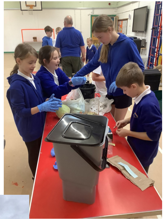
Learning about composting

This year Thwaites School are going to be working hard to improve their local and global environment. They have already made a start with the installation of a compost bin and a litter pick at Haverigg Beach. The STEM experts of Unit 6 joined the children for a day to teach them all about composting and the micro-organisms that make it possible before the children jumped on the school bus and travelled to Haverigg Beach where they used litter pickers to fill bags with rubbish, making their local area a cleaner and safer place. The children will be taking part in environmentally friendly events throughout the year so watch this space.