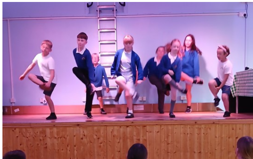
Awards ceremony entertainment