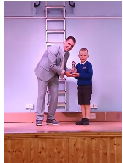
Proud award winner