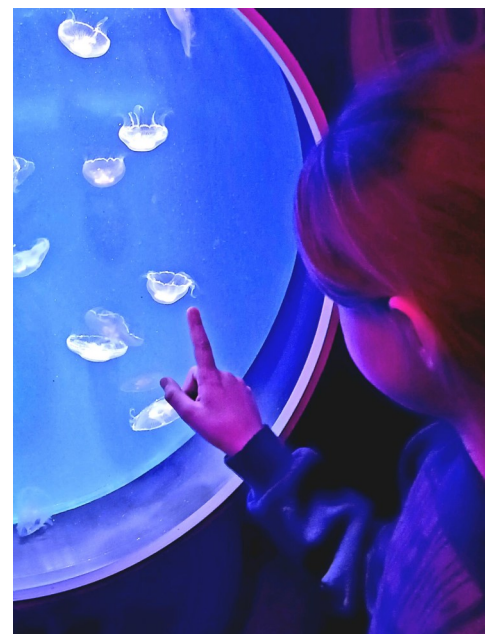
Fascinating sea creatures

Day two began with a river cruise on the Thames, taking in the sights of the city before the class took flight on the London Eye. Soaring above London, the children pointed out