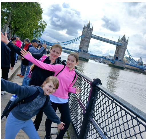
Taking in the London sights

famous buildings and landmarks before coming back down to solid ground. The class then toured the Sea Life