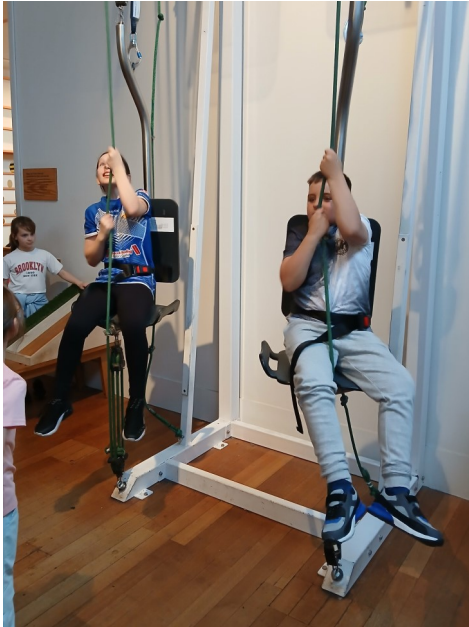
Fun at the Science Museum

The children in Class Three enjoyed a fantastic London adventure as part of their learning in Year Five and Year Six. The class set off bright and early on the Monday morning and arrived in London in the afternoon. They spent that afternoon touring the British Science Museum before enjoying incredible hands-on science activities in the Wonder Lab. After the Science Museum the children tucked into delicious fish and chips at The Great British Fish and Chip Restaurant and ended the day playing in Jubilee Gardens.